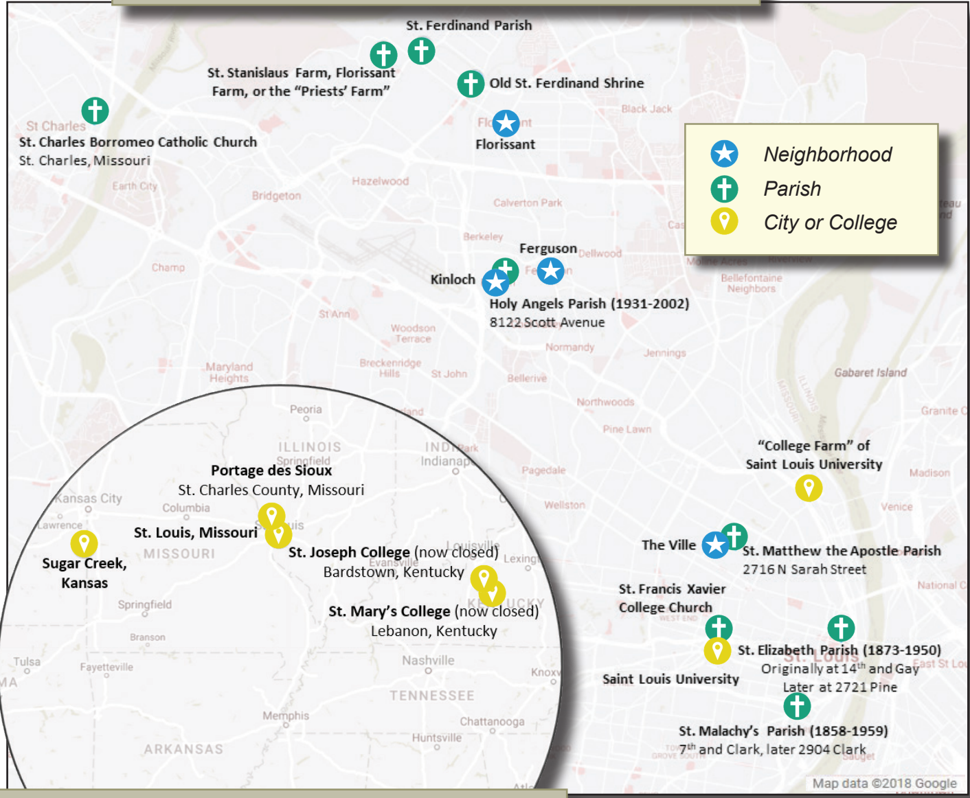
MAP OF CENTRAL UNITED STATES Descendants will also have historic ties to these locations.